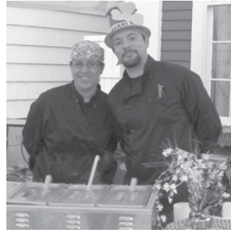
Representatives from On the Rocks ready to serve the 2012 Best Chowder.

Special thanks go out to all of the chefs and businesses for donating their time and chowder. Also thank you to all the community attendees for their donations to support local causes. The EDC will decide which charities and non-profit organizations will receive the approximately $1,000 in proceeds at their April 5th meeting.