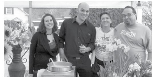
LaVita Gustosa took third place.