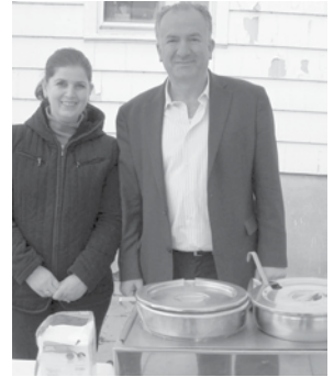
Gelston House took second place.