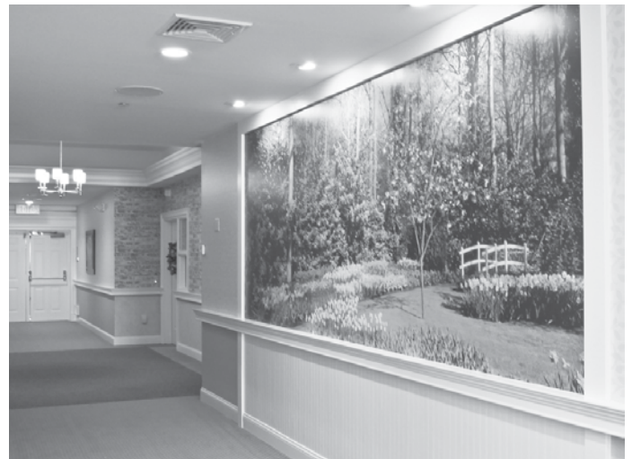
A "Neighbor's House" Mural